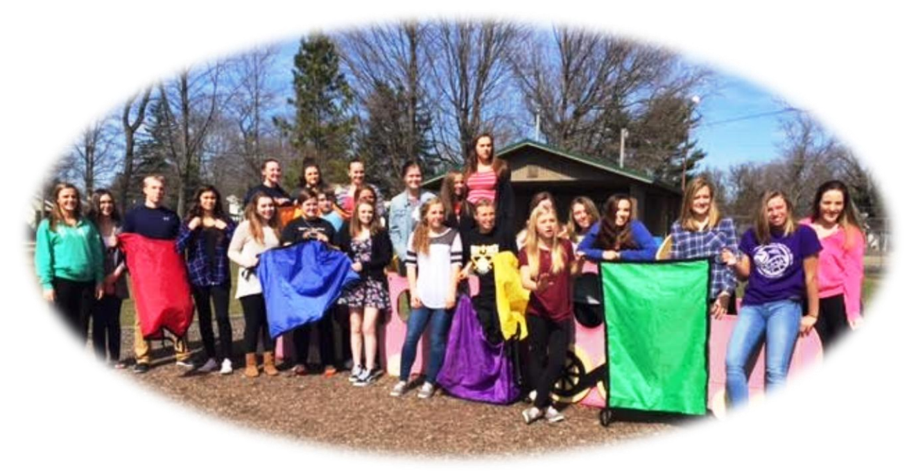
Health Careers Kids Enhancing their Teamwork Skills During Challenge Education